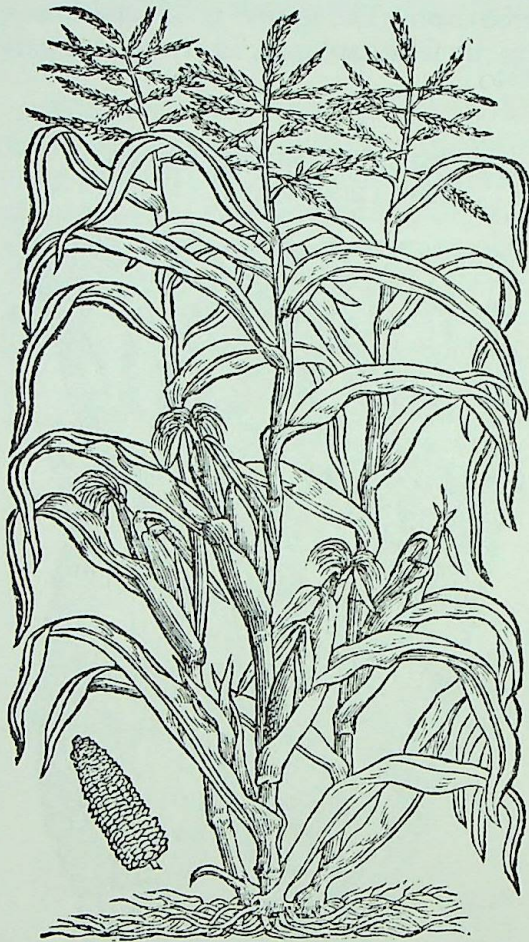
1 Fruentum Asiaticum. Corne of Asia.